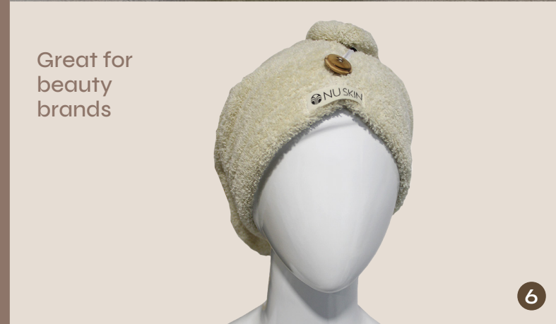
Great for beauty brands