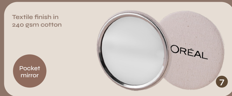
Textile finish in 240 gsm cotton