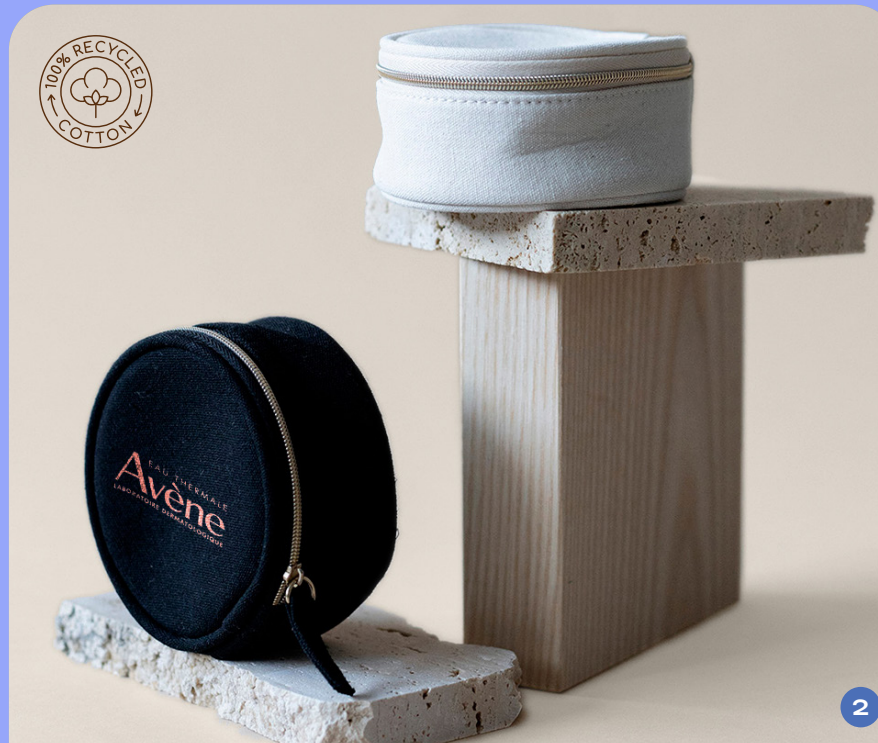
JEWELRY CASE IN RECYCLED COTTON