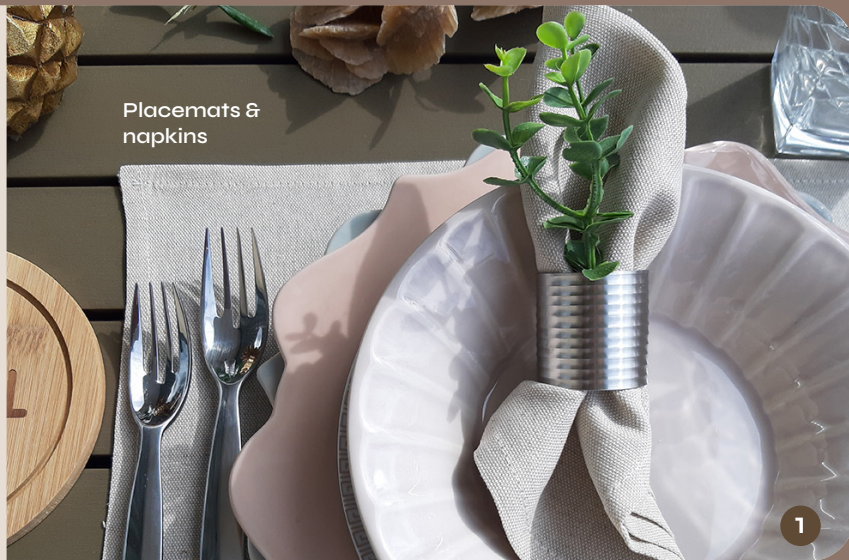
Placemats & napkins