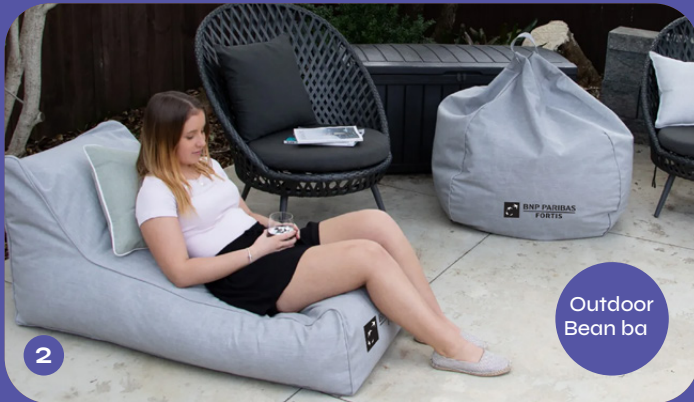
Outdoor Bean ba